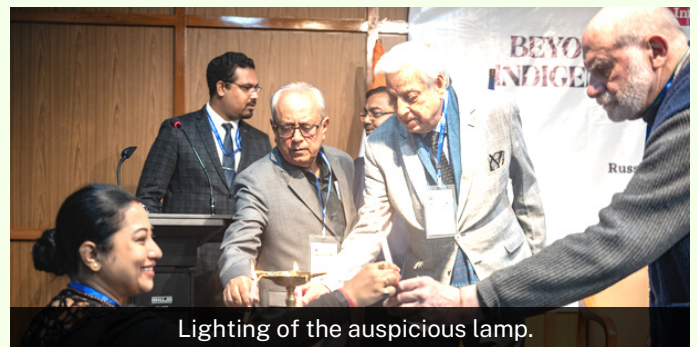
Lighting of the auspicious lamp.