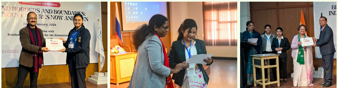
Distribution of certificates to the presenters and participants.