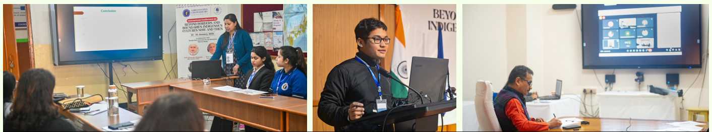
Day 1 witnessed a successful confluence of scholars and academicians sharing insightful and intellectual exchange.