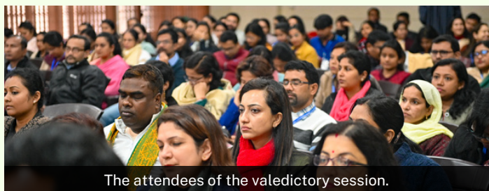
The attendees of the valedictory session.

GCU successfully conducted Day-1 and Day-2 of International Conference with more than 100 delegates, faculty members, academicians, scholars, students and participants from eminent colleges, universities and institutions worldwide. The conference provided a global platform for intellectual exchange and scholarly engagement on Literature and translation, Language revitalization and documentation, Political linguistics, Child language acquisition, Community and identity, Oral tradition, myth and history, The power of storytelling, Cultures under threat, Food customs as cultural identity, Eco criticism, Indigenous music and dance, Indigenous art, craft and artifacts, Indigenous traditions, rituals and practices and AI.