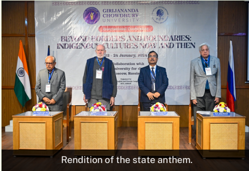
Rendition of the state anthem.