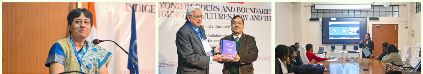
GCU Successfully concluded Day 2 encapsulating the essence of the conference with scholarly engagement and connections that transcend geographical and disciplinary boundaries.