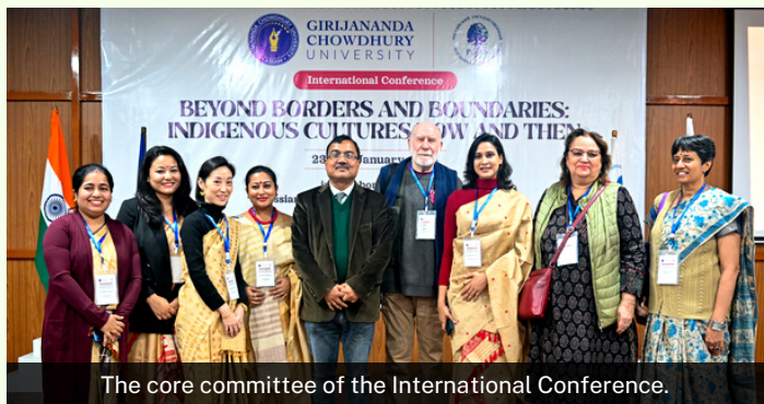
The core committee of the International Conference.