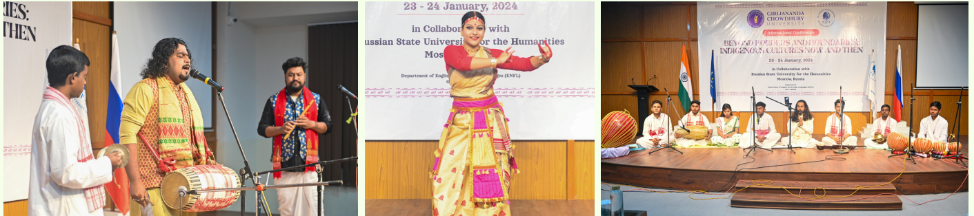
The cultural programme showcasing the various cultures and dance forms of Assam.